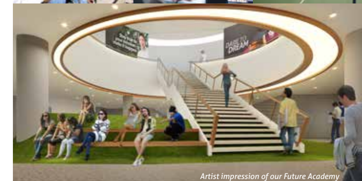
Artist impression of our Future Academy