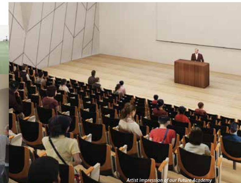
Artist impression of our Future Academy

The Learning Resource Centre provides our students with comprehensive reading resources and is a place for self-study. Our fully air-conditioned Student Hub is an ideal location for project work and group discussions. We also have a cafeteria and a bookstore to cater to our students' needs. For indoor sports enthusiasts, an indoor gym and multi-purpose hall are venues for exercise and activities; and outdoor sports lovers can make the most of the basketball and street soccer courts. Students can also stay connected on our WIFI-enabled campus network.