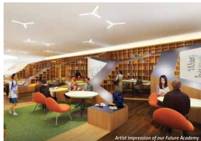
Artist impression of our Future Academy

Student life at PSB Academy is everything but boring! Our students work hard and play hard together; the meeting of minds is more than just being friends. Students are trained to have a global mindset beyond the classrooms. Through our student council, students get to participate in campus-wide activities. In addition, we have Sports Club, Student Clubs and International Student Associations, led by students; learning the fine art of balancing studies and co-curricular activities. Too shy to make new friends? Fret not! Connect+ is an integration programme which focuses on forging friendships among students. Not only will students get to make friends among fellow new students, they also learn about thriving in a multi-cultural learning environment.