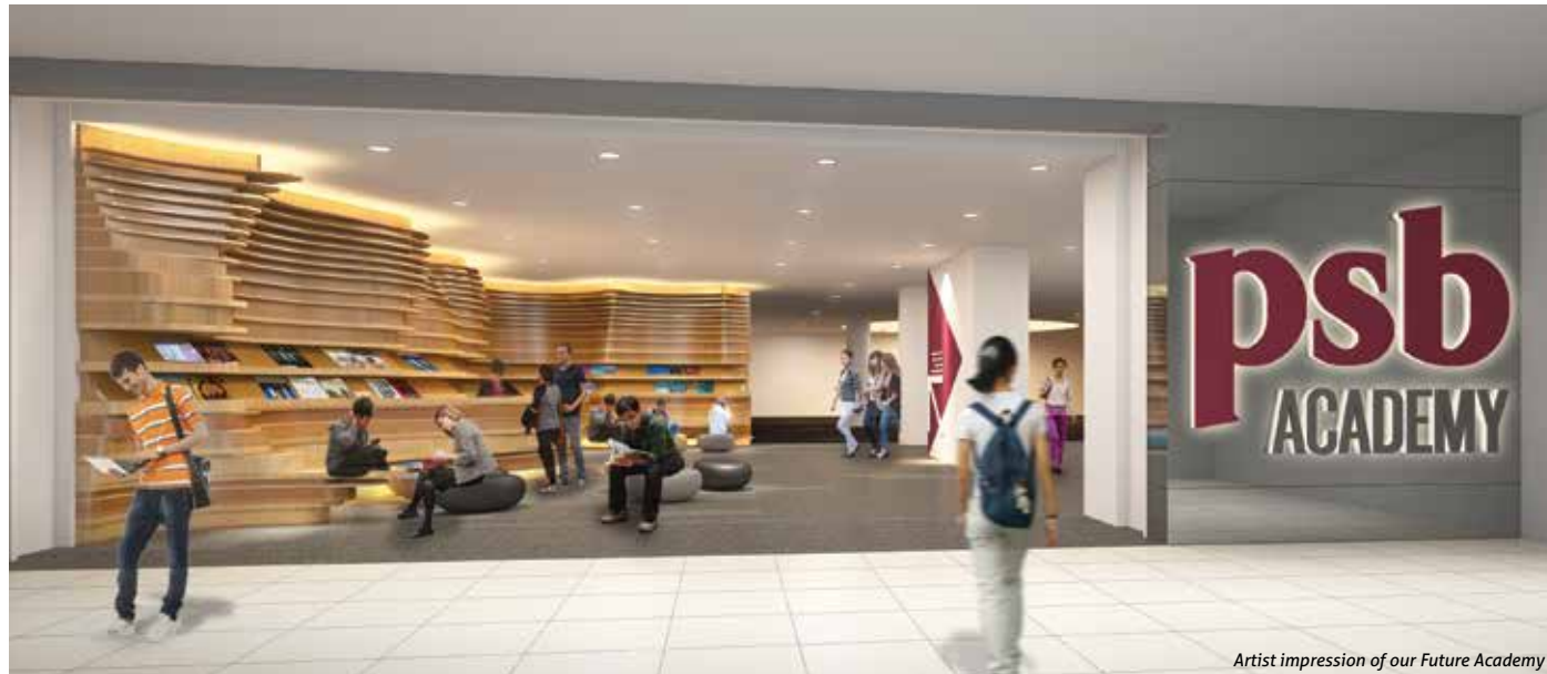
Artist impression of our Future Academy